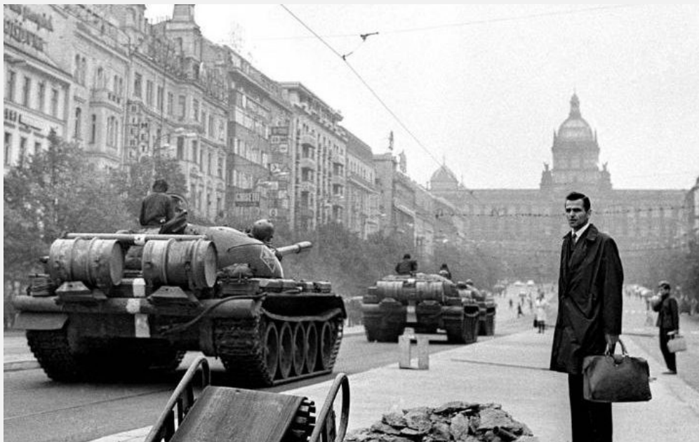
Soviet tanks rumble into Prague

It was the Truman administration that browbeat the French to reach a modus vivendi with Germany in the early post-War years, even threatening to cut off US Marshall aid at a furious meeting with recalcitrant French leaders they resisted in September 1950.